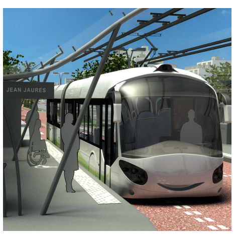
Optiboard is a tried and tested guidance mode. This system derives from the Optiguide guidance system, which has been in service in Rouen since 2001. It is currently fitted to a fleet of over 100 vehicles made by various manufacturers.

Optiquide-Optiboard enables vehicles to be driven very close to the platforms, along an accurate and safe trajectory. Thanks to Optiboard, the gap between the door steps and the platform is optimized, at less than 2 inches. Precision docking is provided for each stop throughout the service life, with a level of availability of over 99.98%. Step-free access does away with the need for a foldaway ramp, reduces alighting and boarding times at the stations, and increases the commercial running speed.