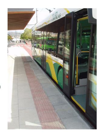
Optiquide - Optiboard: an efficient and reliable accessibility solution, which does not discriminate against people with reduced mobility.

Optiguide-Optiboard can be integrated on all types of vehicles, regardless of manufacturer, and is particularly suitable for lines with platform heights of 23 cm or higher.